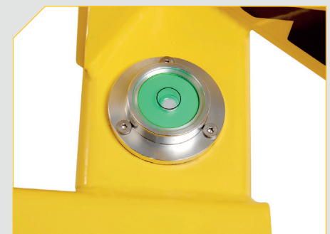
Spirit level to aid the operator to level the chassis.