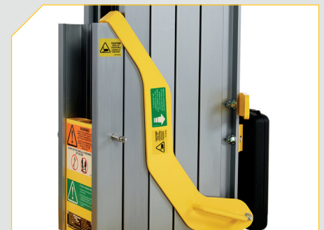
Carriage lock operates in all machine configurations.