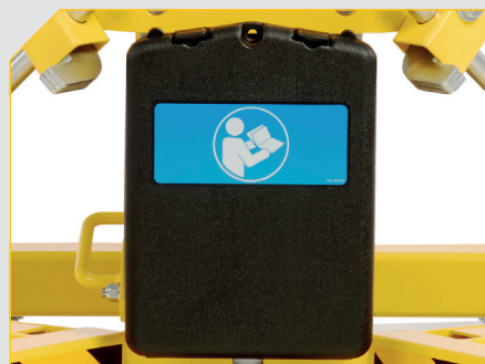
Robust waterproof document holder.