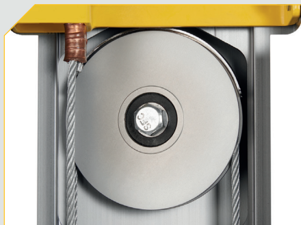
Hard wearing aluminium mast pulley wheels.