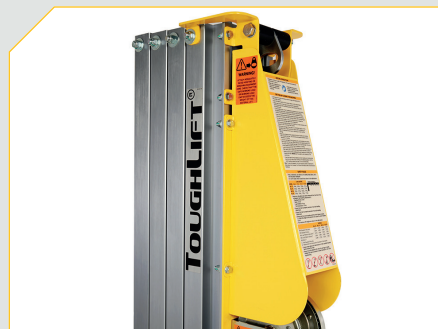
Cable guard with operational and safety decal.