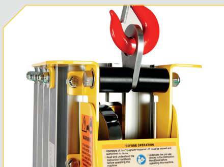
Hoisting and winching anchor.